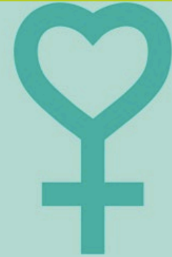
Female Vs Male taxpayers claiming charitable donations 16